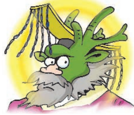
The Dragon King