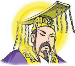
The Jade Emperor of Heaven