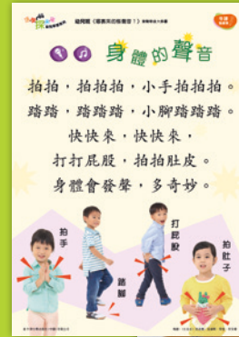
Talking Song Posters

Consolidate children's knowledge and develop their eight generic skills