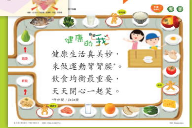
Talking Chant Posters

Please return the completed order form to the school together with a cheque (if applicable) on or before _____. The school will then submit all completed forms to our office for bulk purchase (by email: order.hk@oup.com or fax: 2597 4083).