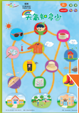
Talking Game Posters

Help children recognize the target words and acquire relevant knowledge