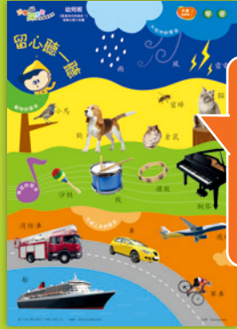
Talking Theme Poster

Designed to match the theme of every Exploration Learning Pack, including the Talking Theme Poster, Talking Game Poster, Talking Chant Poster and Talking Song Poster.