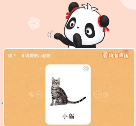
Interactive word cards

Compatible with desktop computers/ tablets/smartphones