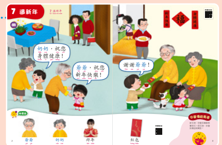
E-books (with Pinyin)