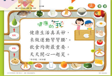
Talking Chant Posters

Please return the completed form to your child's school by _____ for bulk purchase. (All collected forms should be sent to Oxford University Press by email: order.hk@oup.com or fax: 2597 4083)