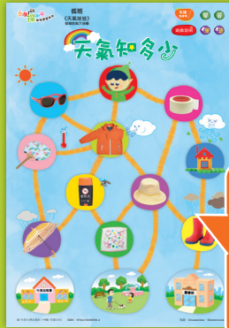
Talking Game Posters

Help children recognize the target words and acquire relevant knowledge