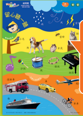
Talking Theme Poster

Designed to match the theme of every Exploration Learning Pack, including the Talking Theme Poster, Talking Game Poster, Talking Chant Poster and Talking Song Poster.