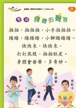
Talking Song Posters

Consolidate children's knowledge and develop their eight generic skills