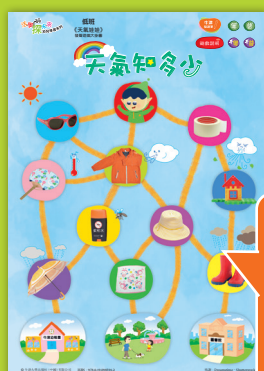
Talking Game Posters

Help children recognize the target words and acquire relevant knowledge