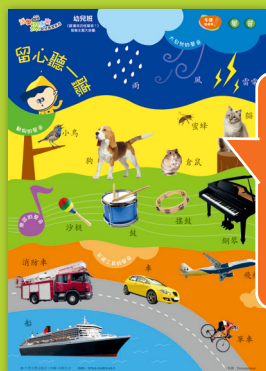
Talking Theme Poster

Help children recognize the target words and acquire relevant knowledge