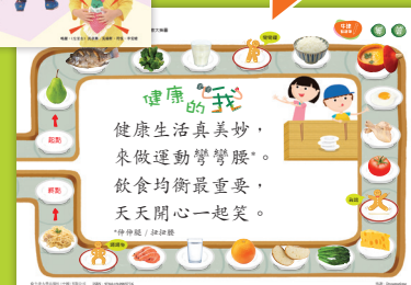
Talking Chant Posters

Please return the completed form to your child's school by _____ for bulk purchase.