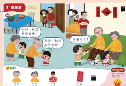
E-books (with Pinyin)