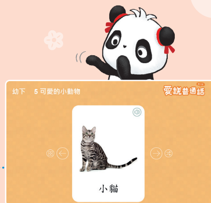
Interactive word cards