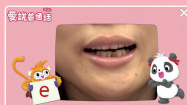
Sound demo videos