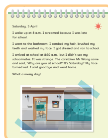
School magazine article