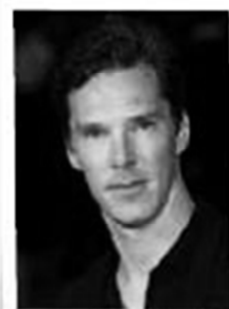
Benedict Cumberbatch plays Sherlock Holmes