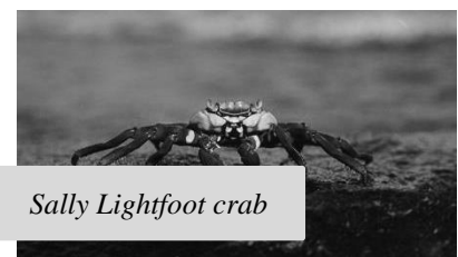
Sally Lightfoot crab