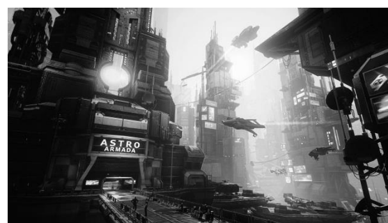
Screenshot from Star Citizen

⑤ Another benefit of crowdfunding is free media attention for your product. In 2012, programmers asked the public for US$2 million to develop the massively multiplayer online game Star Citizen . Delighted gamers 50 generously chipped in. As word of the game spread, more and more investment poured in. The video game designers decided to expand the game. This invited more investment. Investment snowballed and the game's fame grew. This cycle repeated itself for several 55 years. Now Star Citizen has over US$150 million of investment. It is set to become one of the biggest online video games ever.