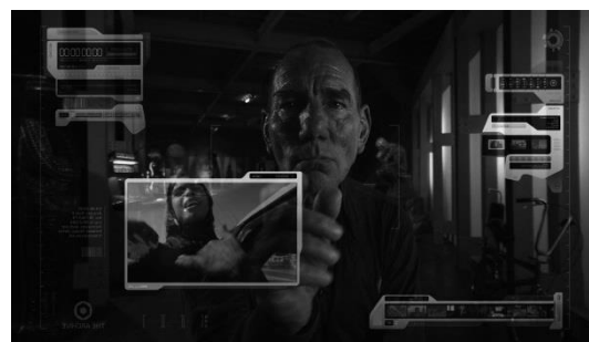
The Age of Stupid is about a man from 2055, where climate change has destroyed the world, looking back at our present time.