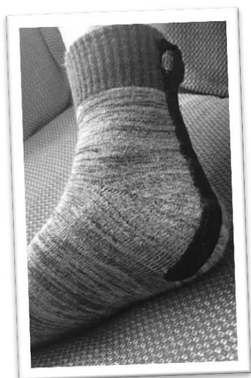
The 'smart sock' Kenneth invented