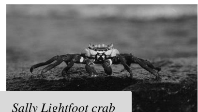
Sally Lightfoot crab