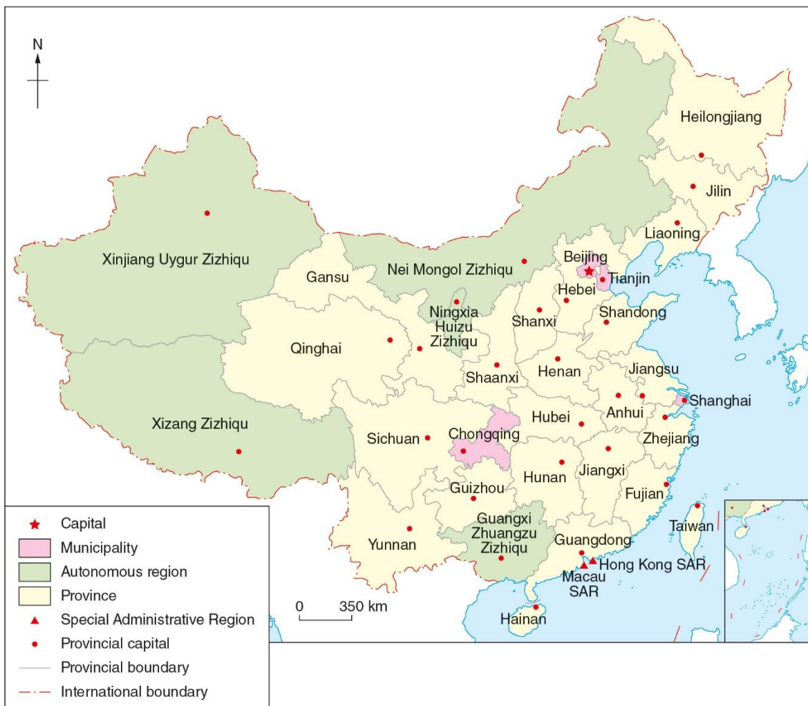
Figure 4 Locations of administrative areas in China