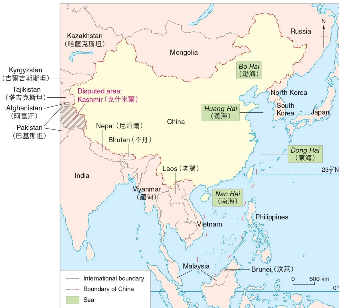
Figure 3 The territory of China and its neighbouring countries