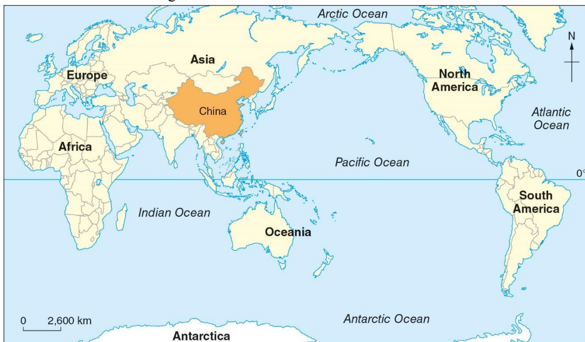
Figure 1 The location of China in the world